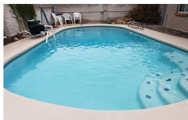
Step 8 - Cleared, softened water.