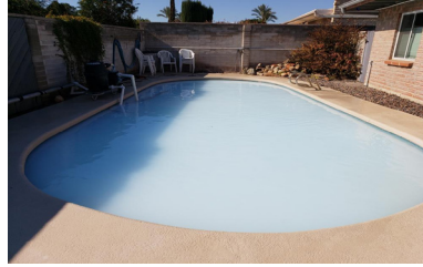
Step 5 - Milking complete.