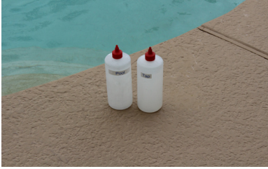
Step 1 - Pre-testing the water.