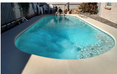
Step 4 - Milking the pool.