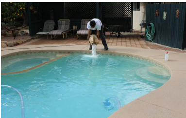
Step 3 - Dumping in the soda ash.