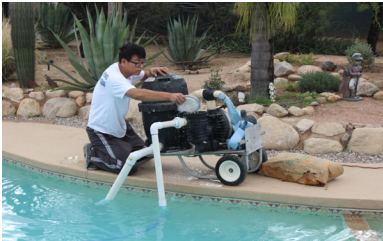
Step 2 - Preparing the DE filter.