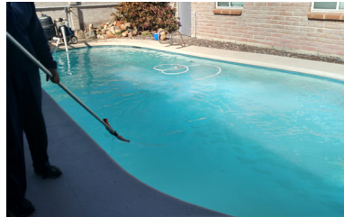
Step 6 - Brushing each day to stir things up for the filter and to prevent sticking onto the plaster.